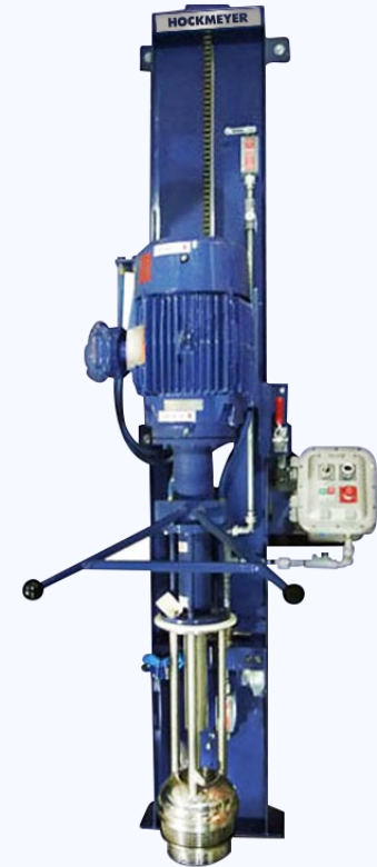
HCP – Drum Mill