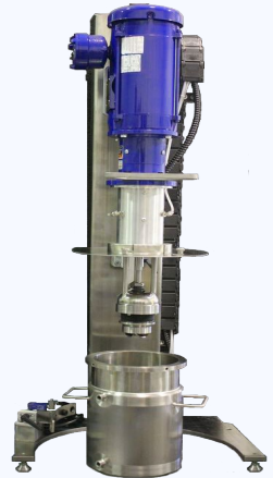
HCP - 1/4