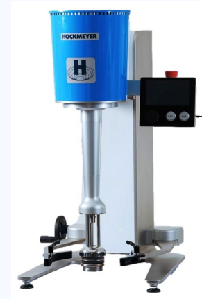
Micro Mill - Lab